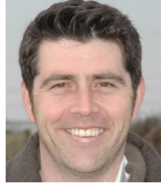
Scott Mann MP Treasurer