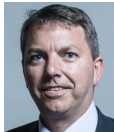
Gareth Johnson MP Vice Chair