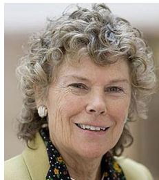
Kate Hoey MP Vice Chair