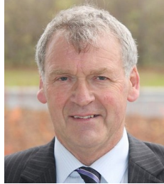
Glyn Davies MP Secretary