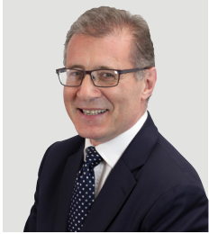
Mark Pawsey MP Chair